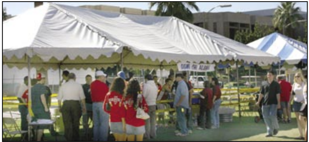
Brothers, family and friends enjoy themselves at the tent on the Mall during Homecoming.