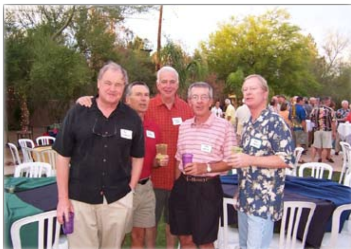
Brothers enjoying SSI 2007. See article on page 6.

In the past years as we have worked toward the re-colonization of the Chapter and through various alumni events, one common thread has surfaced: The experiences and lessons learned at the Beta Phi Chapter and the qualities of Sigma Chi Fraternity have had a significant impact on our alumni brothers of all ages and decades. Many met their wives through Sigma Chi, found lifelong friendships and contacts, and have said the lessons of Sigma Chi have served them well.